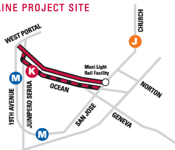
Bus substitution route follows the construction route "San Jose Avenue to Junipero Serra Boulevard, ending at West Portal." — Bus Substitution - - - K-Line Construction Area